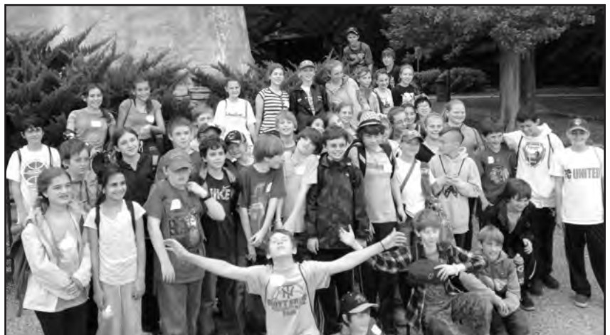
Left: Seventh graders learned about invasive species on a field trip to the Forest Preserves. Right: Sixth graders extended their wildlife and ecology studies during Outdoor Education at Lorado Taft. (See article at right.)