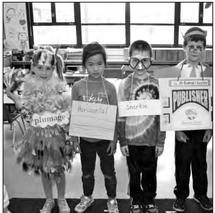
Students dressed as one of their favorite words for the annual vocabulary parade. The parade culminates a school-wide emphasis on learning, practicing and mastering the meaning of new words to develop a rich and robust vocabulary. The theme of this year's vocabulary studies was "Vocabulympics: Win the gold with words!"